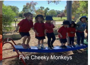
Five Cheeky Monkeys